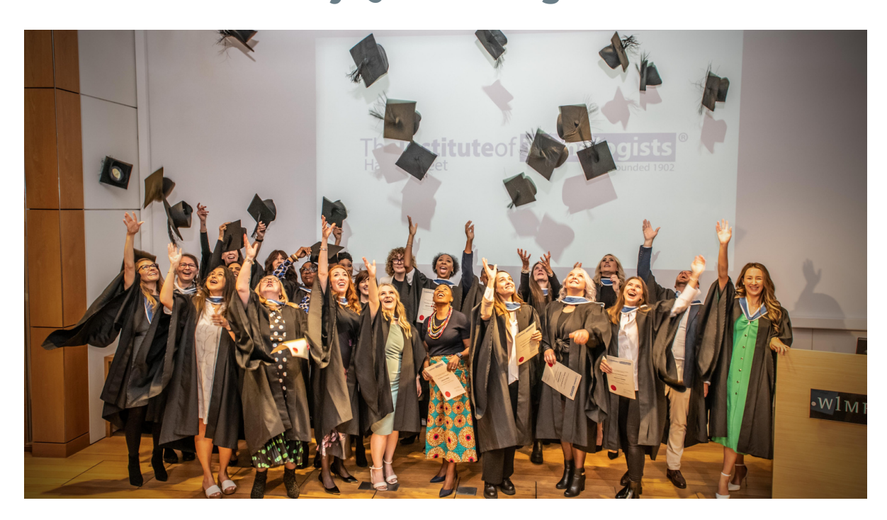
Our Newly Qualified Registrants...